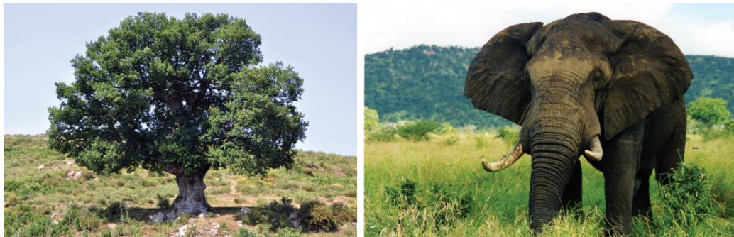
(a) K-selected species