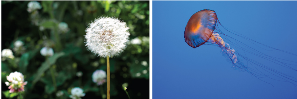
(b) r-selected species

Figure 45.13 (a) Elephants are considered K-selected species as they live long, mature late, and provide long-term parental care to few offspring. Oak trees produce many offspring that do not receive parental care, but are considered K-selected species based on longevity and late maturation. (b) Dandelions and jellyfish are both considered r-selected species as they mature early, have short lifespans, and produce many offspring that receive no parental care.