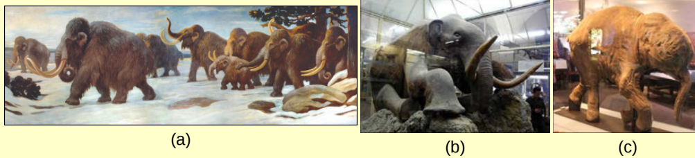
Figure 45.12 The three photos include: (a) 1916 mural of a mammoth herd from the American Museum of Natural History, (b) the only stuffed mammoth in the world, from the Museum of Zoology located in St. Petersburg, Russia, and (c) a one-month-old baby mammoth, named Lyuba, discovered in Siberia in 2007. (credit a: modification of work by Charles R. Knight; credit b: modification of work by "Tanapon"/Flickr; credit c: modification of work by Matt Howry)

It's easy to get lost in the discussion about why dinosaurs went extinct 65 million years ago. Was it due to a meteor slamming into Earth near the coast of modern-day Mexico, or was it from some long-term weather cycle that is not yet understood? Scientists are continually exploring these and other theories.